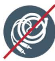
No Tangles (no hoses, wires, chains, or electronics)

Do not include any items just because they are made or contain paper, metal, plastic or glass.