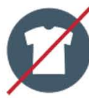
No Clothing or Linens (use donation programs)