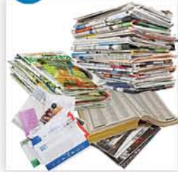
Printed Paper loose