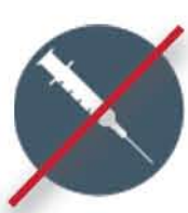
No Needles and/or Hazardous Materials