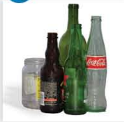
Bottles and Jars empty and rinse