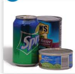
Aluminum and Steel Cans empty and rinse