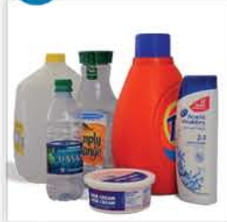
Kitchen, Laundry, and Bath: Bottles & Containers empty and replace cap