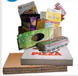
Boxes and Cardboard flatten