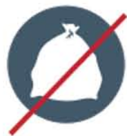
No Garbage Please