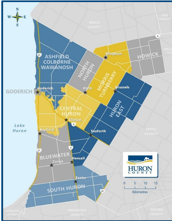
Huron County Map

The Huron County Accessibility Advisory Committee (HCAAC) serves as the Accessibility Advisory Committee (AAC) for Huron County, mandated by the Accessibility for Ontarians with Disabilities Act (AODA), 2005, S.O. 2005, c. 11 . HCAAC is dedicated to advising Huron County Council on the implementation of accessibility standards across the County's nine partner municipalities (see Appendix for HCAAC's objectives and priorities). Comprising primarily of individuals with disabilities, the committee plays a vital role in creating an accessible community by providing input on accessibility plans, site developments, and public spaces. Through education, consultation, and advocacy, the HCAAC ensures that Huron County remains inclusive and accessible for everyone.