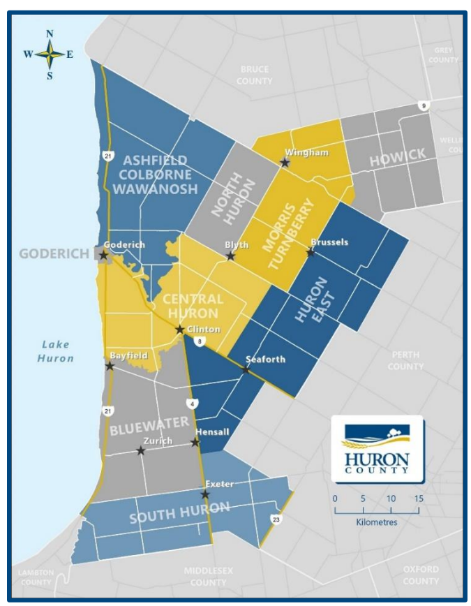
Huron County Map